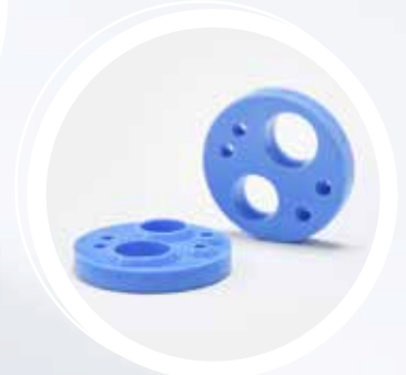
▲ Dental Equipment