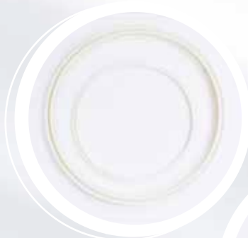
▼ Drug Manufacturing Process