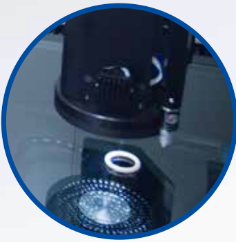
FQC Class 10000