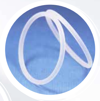
▼ Blood Filter-LSR