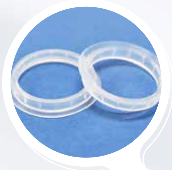
▼ Sterile Connector