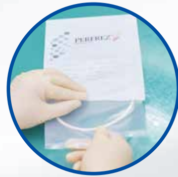
Packing Class 100