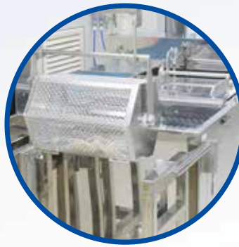
Ultrasonic-DI Water Clean Class 100