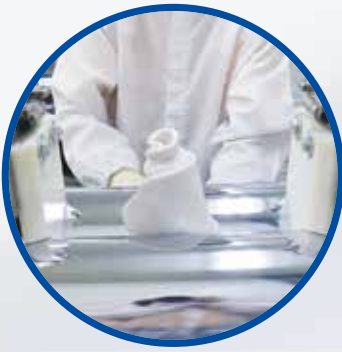
Compounding Class 10000