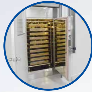
Post Curing Class 1000